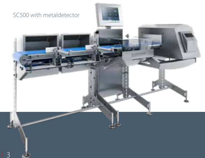
SC500 with metaldetector

The SC500 is available with a wide range of conveyor dimensions, making it possible to handle several product sizes and packing types, e.g. bags, glasses as well as boxes and cans.