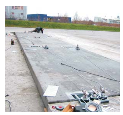
Cablings are drawn to the load cells.