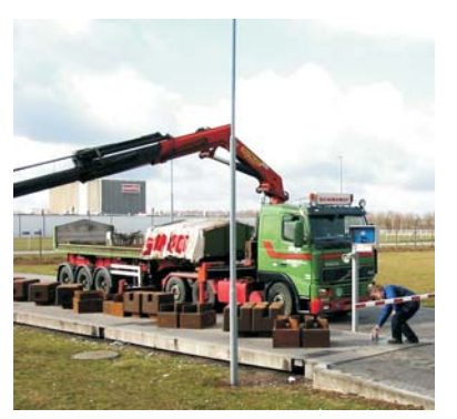
After calibration: The 6800 is ready for use.