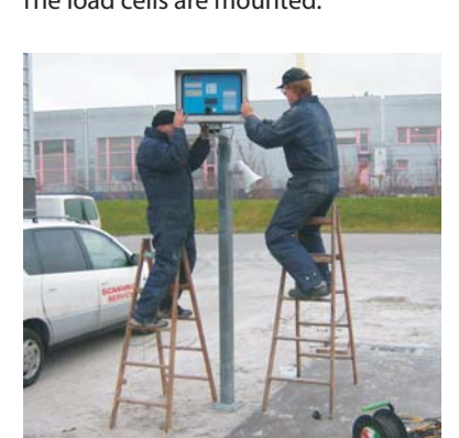
The data terminal is connected.